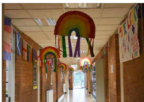
Year 8 hub

The pupils really enjoyed themselves and engaged fully with the activities which provided them with an insight into the sampling techniques real world ecologists use!