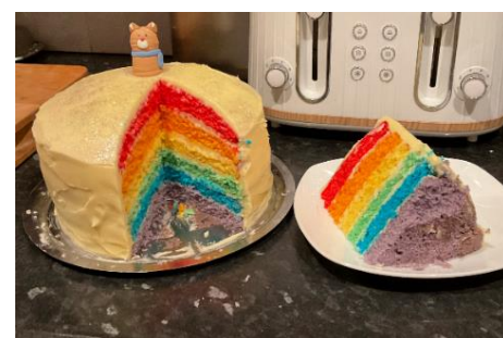
Phoebe W's rainbow cake

We hosted Pride Week 5 th -9 th July this term. There were a variety of activities on offer for pupils and staff to participate in such as a pride badge design competition, film festival, bake sale, LGBTQ+ music icons session and a pride themed non-uniform day.